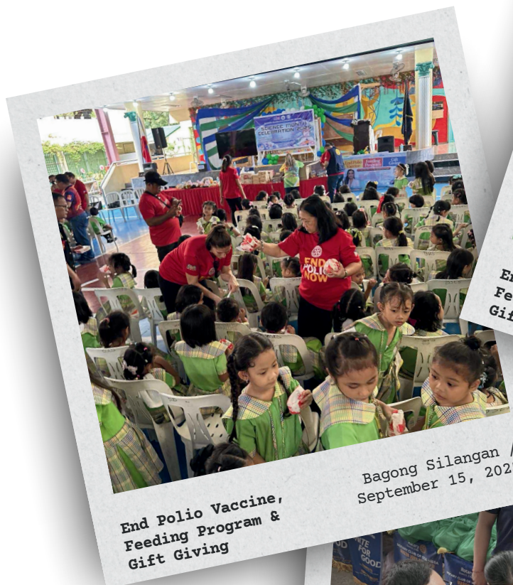
End Polio Vaccine, Feeding Program & Gift Giving