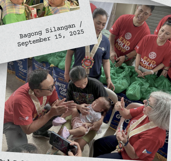
End Polio Vaccine, Feeding Program & Gift Giving