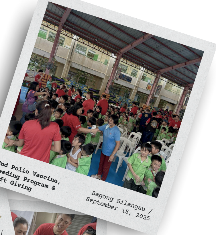
End Polio Vaccine, Feeding Program & Gift Giving